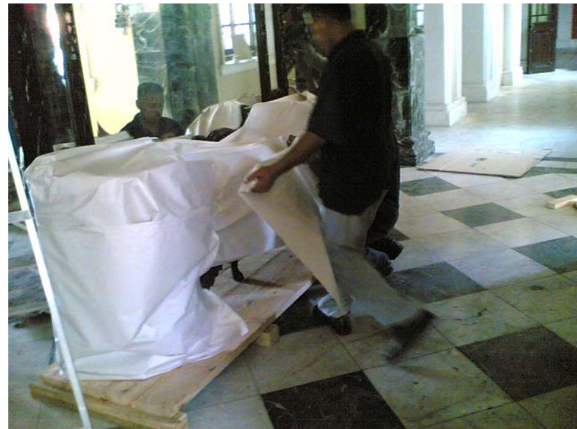
CURIO PACK - PREPARED BY LEE WEI KOON