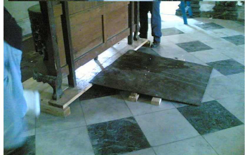
CURIO PACK - PREPARED BY LEE WEI KOON