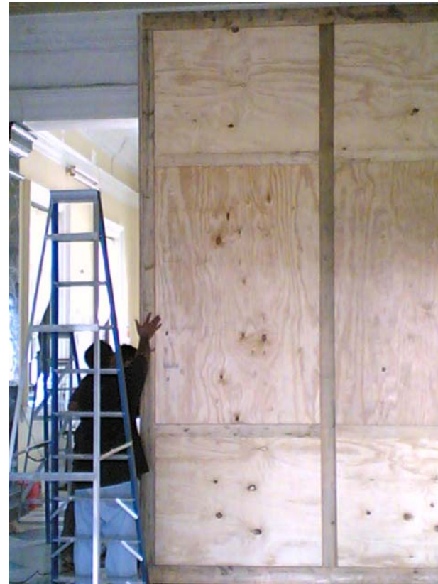
CURIO PACK - PREPARED BY LEE WEI KOON