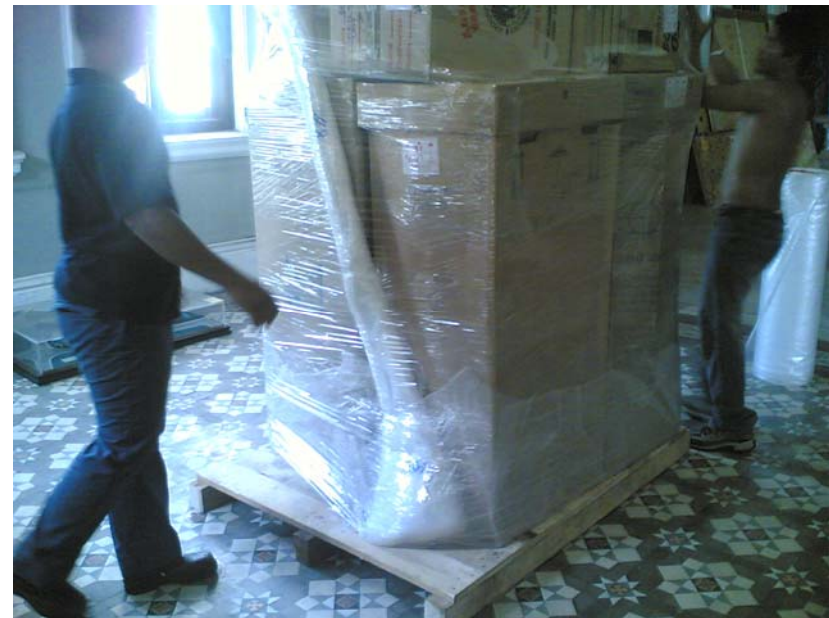
CURIO PACK - PREPARED BY LEE WEI KOON