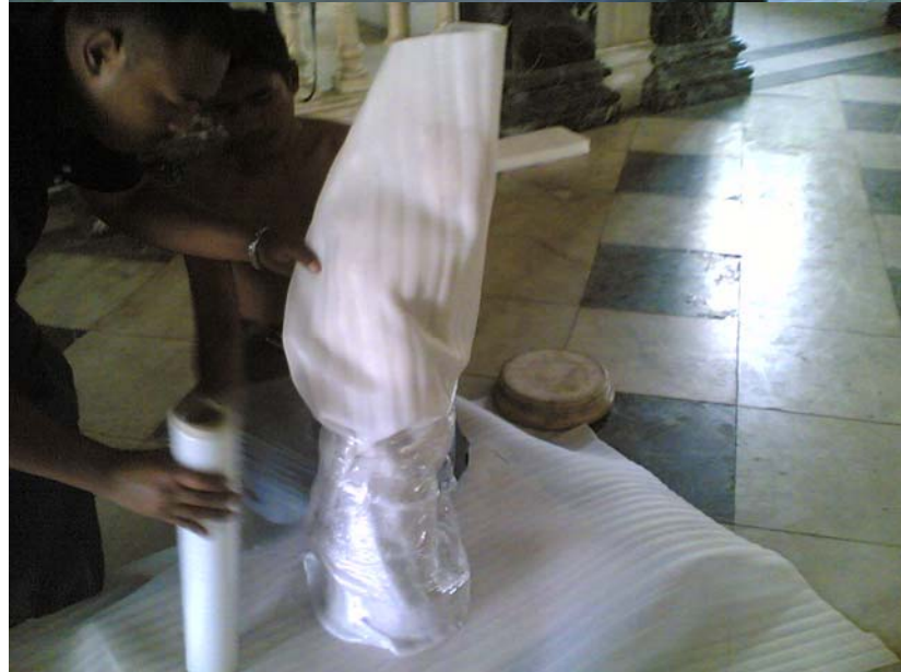
CURIO PACK - PREPARED BY LEE WEI KOON